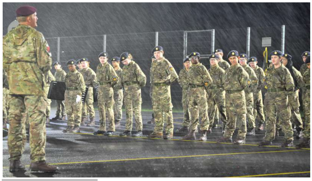
BY TOLA OLAWOYE